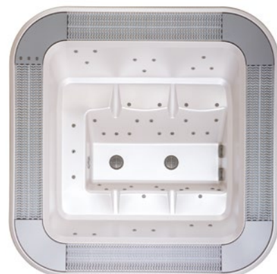
Alternative variant of the jet set